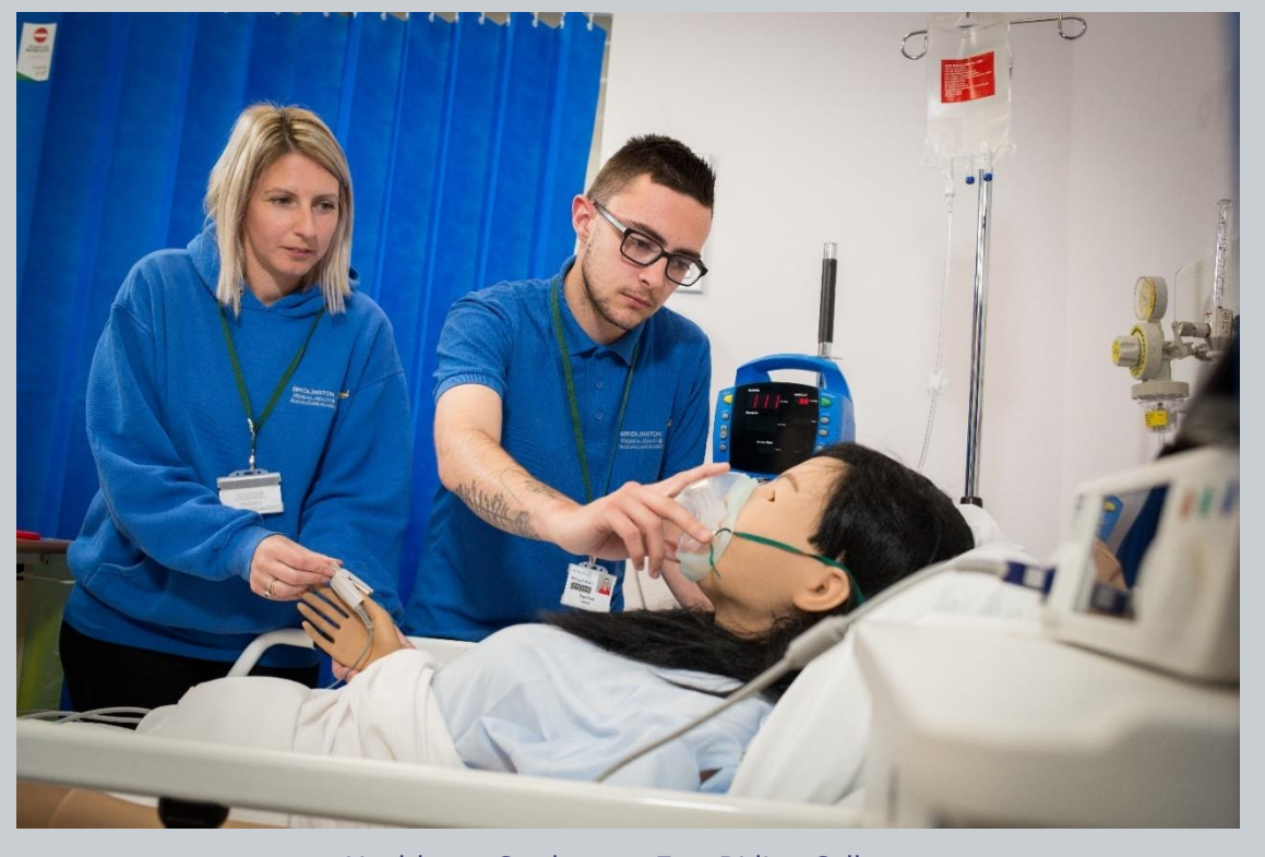
Healthcare Students at East Riding College